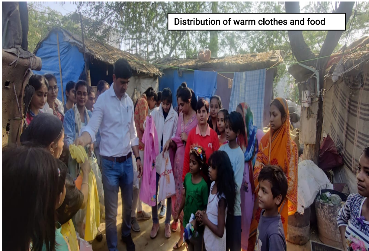
Distribution of warm clothes and food